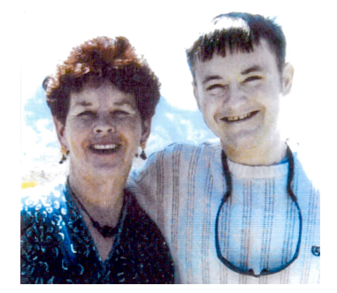
I Can Choose...